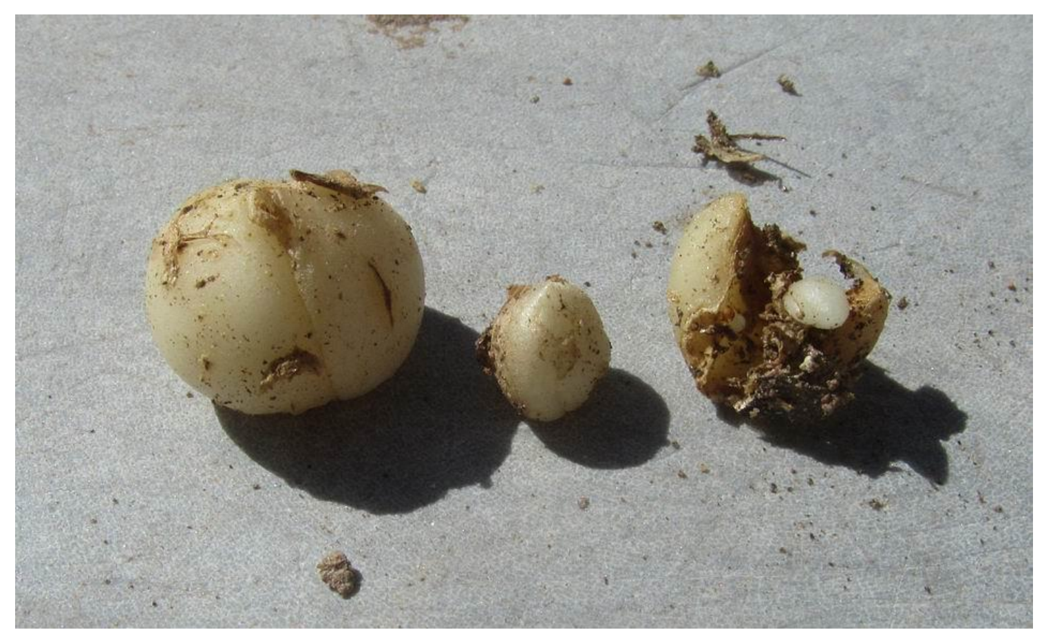
One healthy Fritillaria bulb, one small offset plus the remains of one rotted bulb which is producing new bulbils from the intact remains of the scales illustrates how bulbs want to survive, possessing a number of ways of regenerating from such problems.