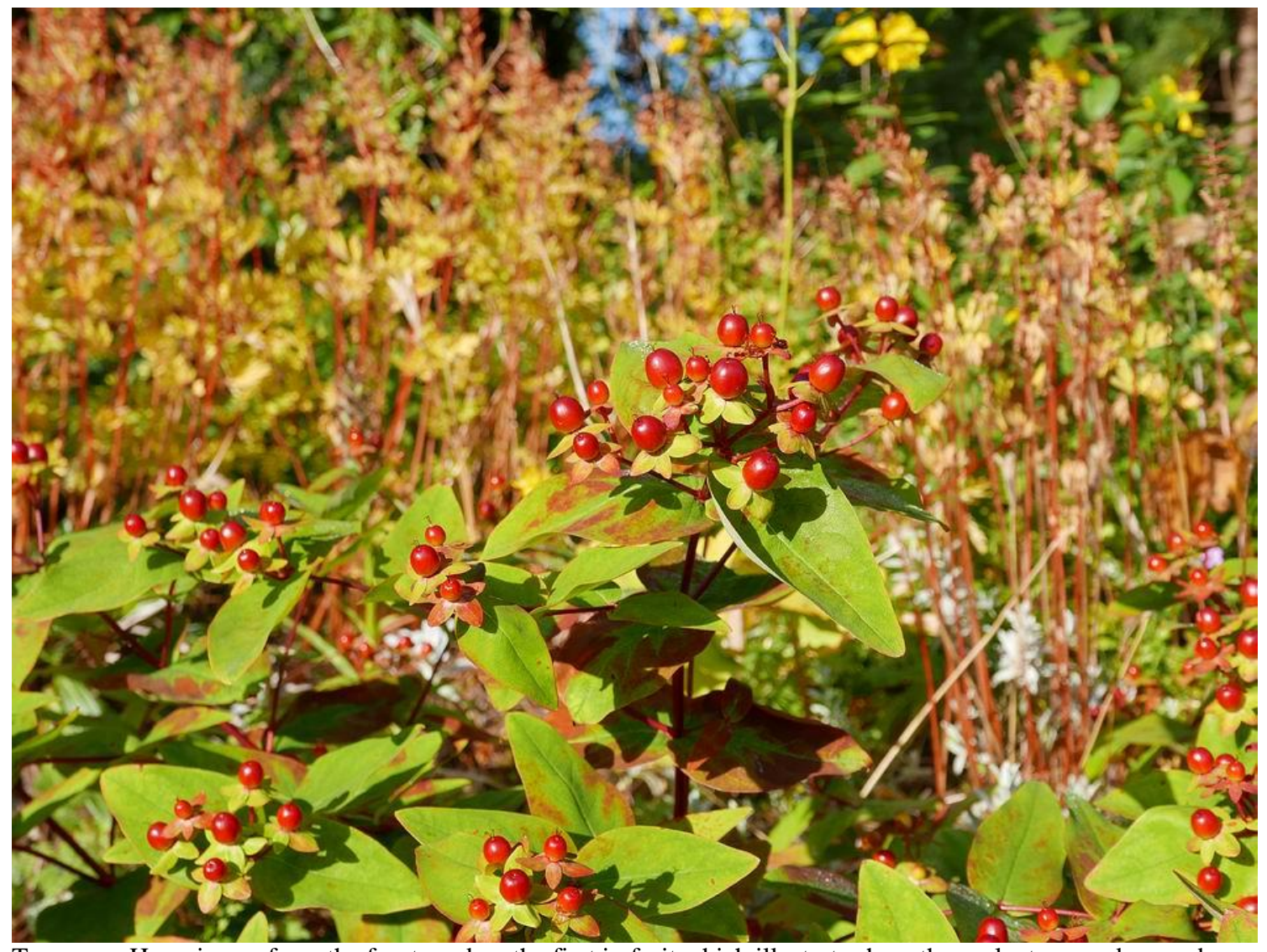
Two more Hypericums from the front garden; the first in fruit which illustrates how these plants spread around so freely - volunteering in many gardens as they did in ours.