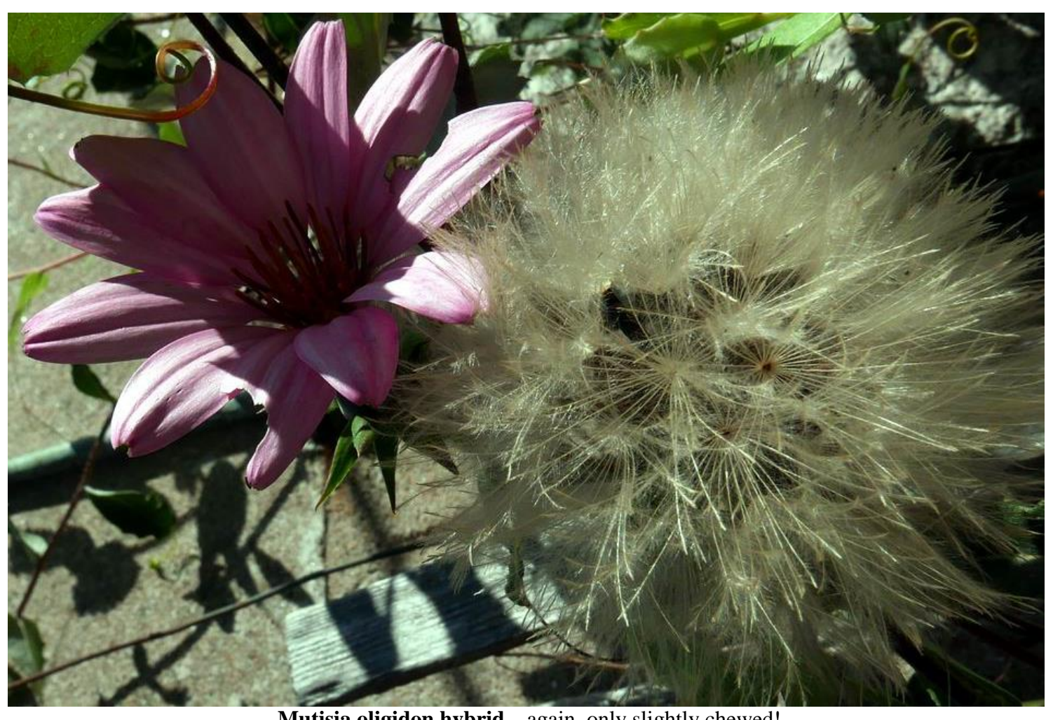
Mutisia oligidon hybrid – again, only slightly chewed!

This Mutisia flower and seed head allows me to experiment more with my new camera learning how to use the different features and see how the changes affect the resulting image.