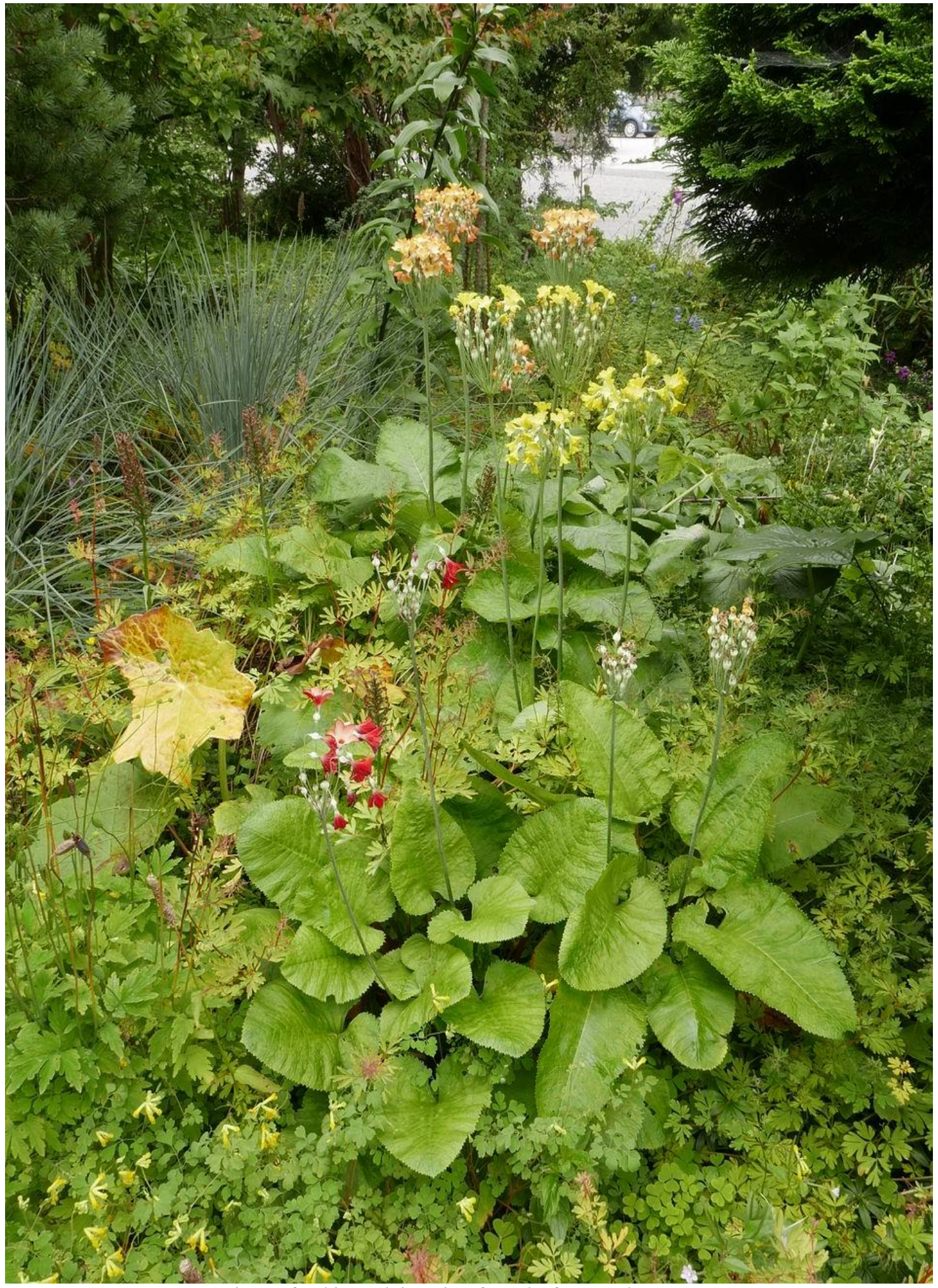
Last image for this week is a view from the front garden.....