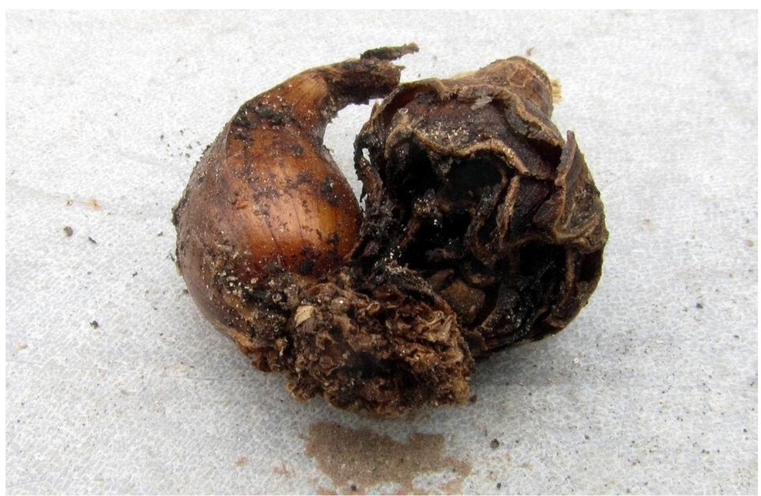
I find bulbs fascinating and it is often the ones with damage that are the most interesting. What has caused one of these twin bulbs to have a dead, hollowed-out centre? Was it a narcissus fly grub, a slug or simply rot? It is hard to know.