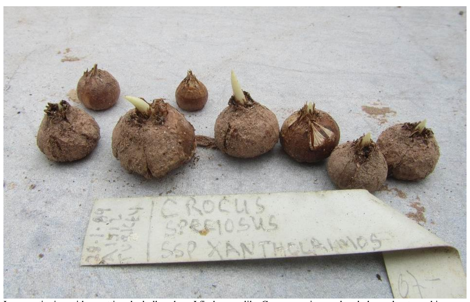
I am continuing with repotting the bulbs where I find some, like Crocus speciosus, already have shoots pushing upwards: soon there will be flowers. Notice there are no roots at this time which is why you should take care not to over-water autumn flowering Crocus in pots – water when the leaves appear that is when the roots will be growing.