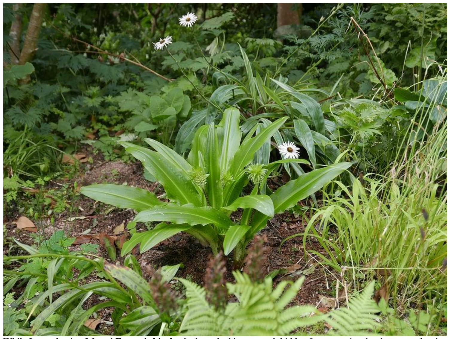
While I was clearing I found Eucomis bicolor had sneaked into growth hidden from our view by the mass of spring and summer growth.

As I cleared I also exposed quite a lot of weeds which I dealt with using one of my favourite garden hand tools.