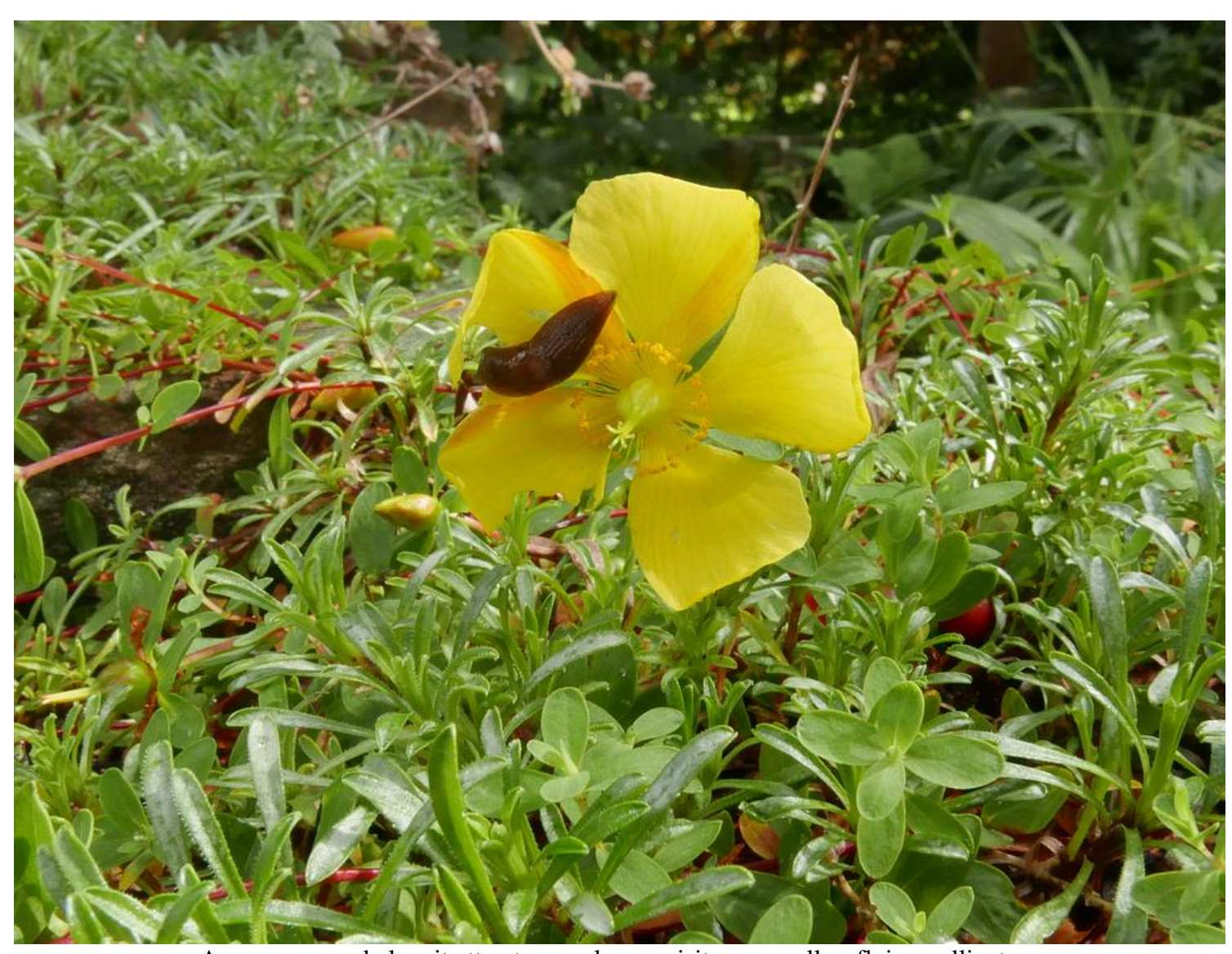
As you can see below it attracts unwelcome visitors as well as flying pollinators.

Another plant with the same spreading mat-type growth, Hypericum reptans, shares the same slab bed and flowers around the same time - this one is bright yellow. It flowers over a very long period with a constant display of flowers and attractive buds that will keep going until the winter really sets in.