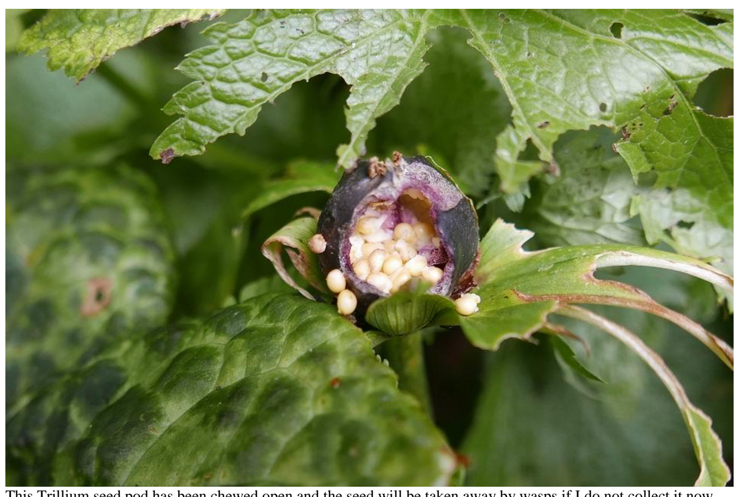
This Trillium seed pod has been chewed open and the seed will be taken away by wasps if I do not collect it now.