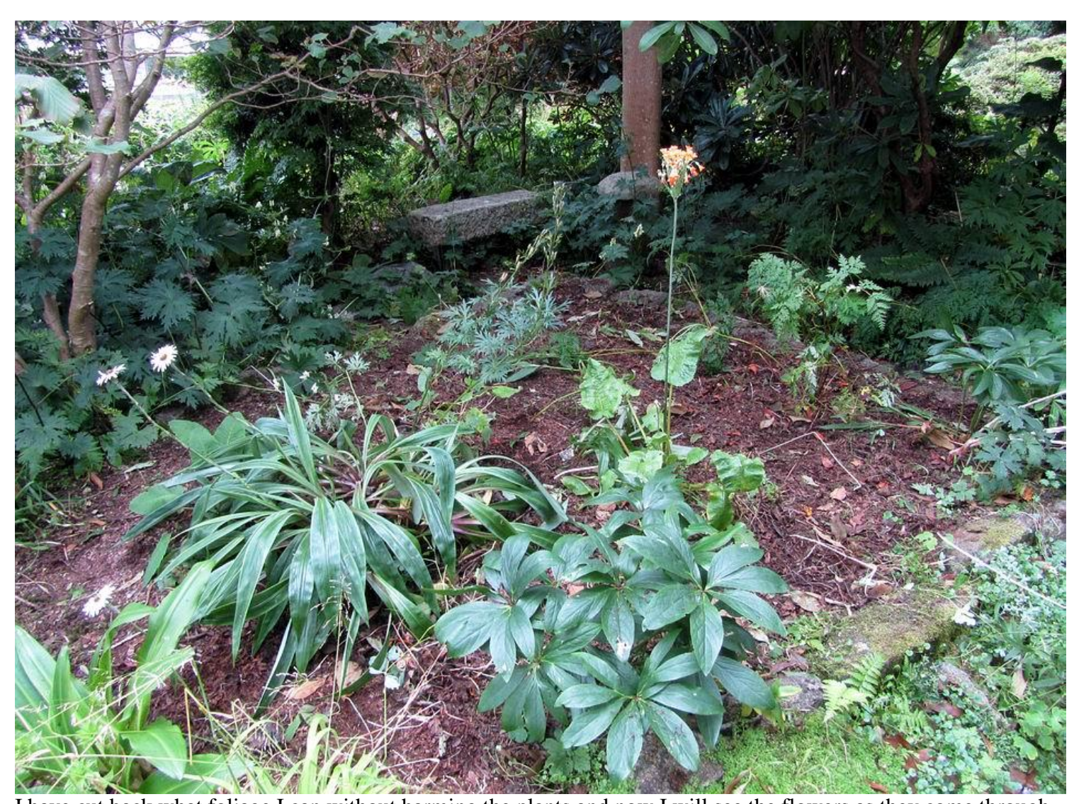
I have cut back what foliage I can without harming the plants and now I will see the flowers as they come through.

Round the back there is work to be done in clearing some of the old growth from the bulb bed. In many beds I leave this growth to die back naturally over the winter but as there are Autumn flowering Colchium and Crocus in this bed and I want to be able to see the flowers unhindered by so much old foliage.