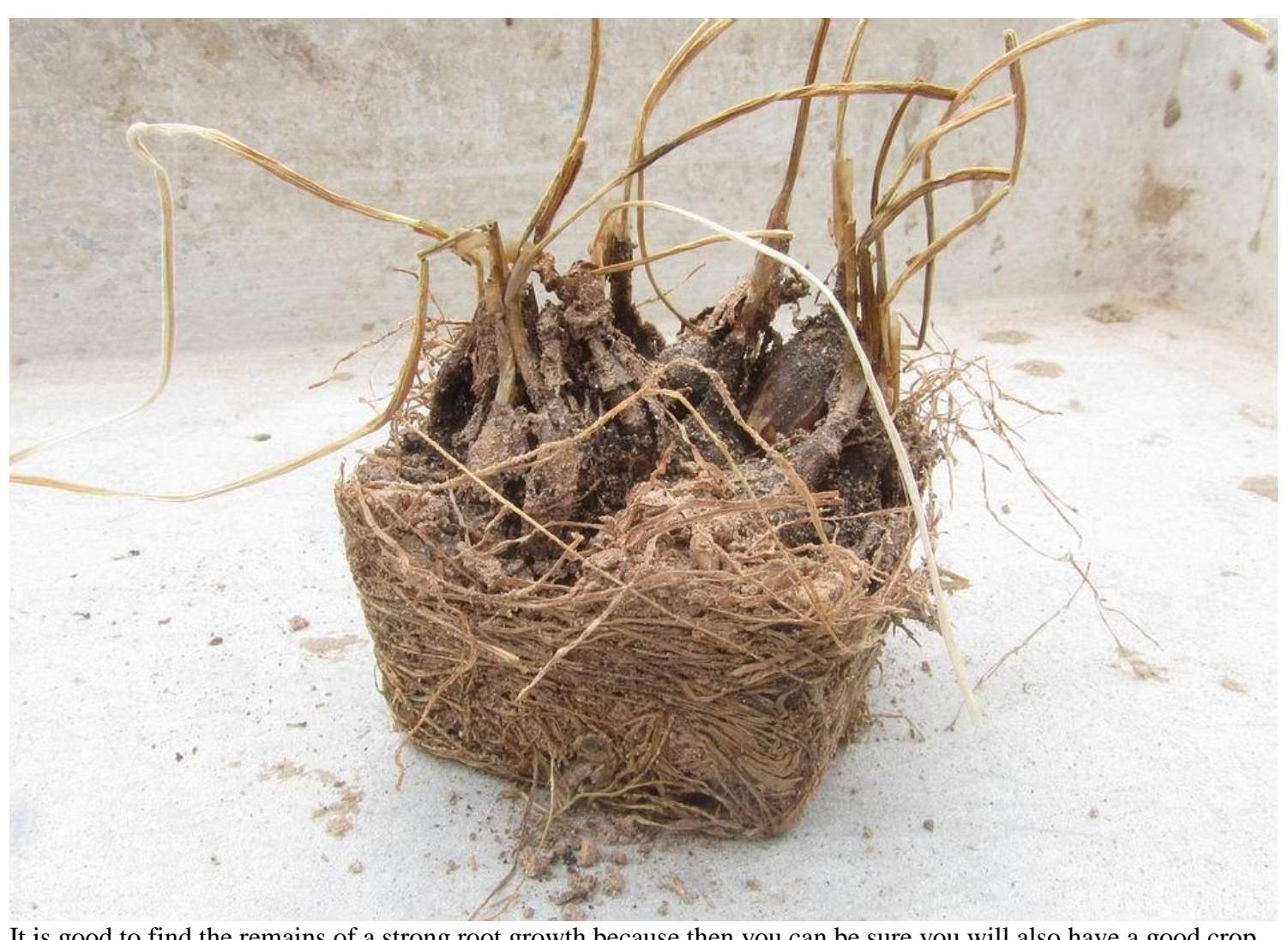
It is good to find the remains of a strong root growth because then you can be sure you will also have a good crop of bulbs.