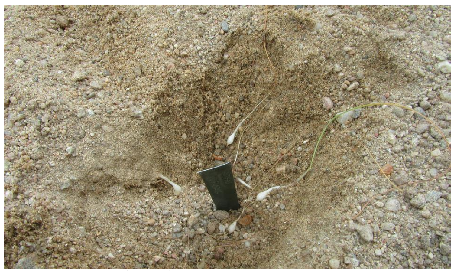
Narcissus viridiflorus seedlings planted in sand with the label.

I will of course continue to grow a lot of bulbs in pots but will cut it back to a number that I can better cope with while at the same time I have an exciting new variation to my growing methods.